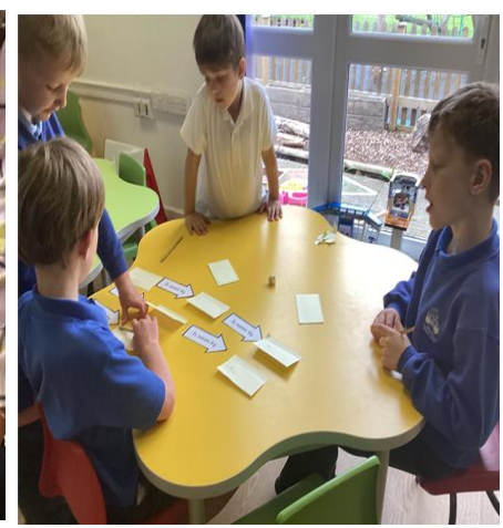
Emerald Class have enjoyed using their journals in their Myhappymind sessions, creating illustrations based on their new book in reading lessons and performing in the puppet show at the Year 4 Church School Festival