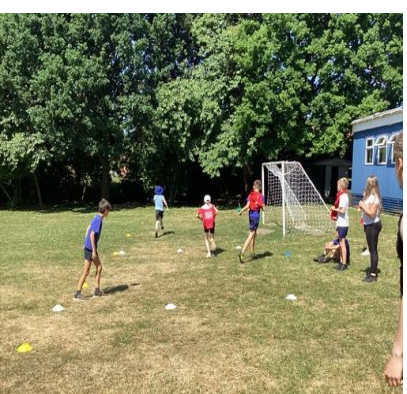
Follow us on twitter: @WelbournEmerald @WelbournAmethy1 @Topazclass1 Follow us on Facebook: Welbourn Church of England Primary School Follow us on Instagram: welbournschool