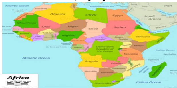
A map of Africa.

More than 50 countries make up the continent.