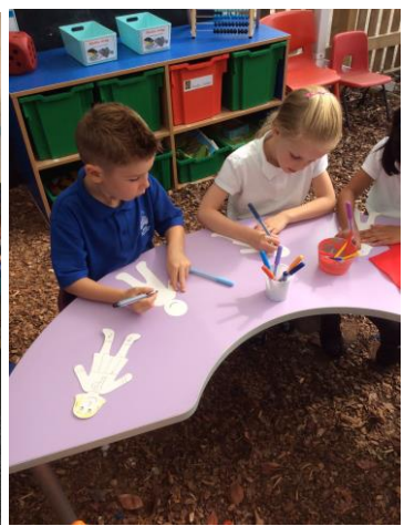
Emerald Class have been painting self-portraits, pretending to be Roman soldiers, making shields and learning about solids, liquids and gases in science.