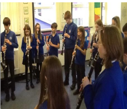
We enjoyed our special assembly with Sam Ruddock the Olympic gold medallist!