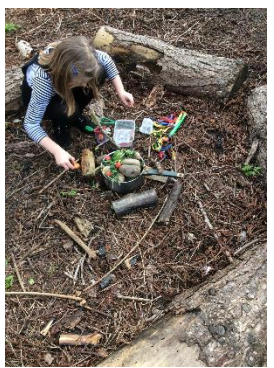
Amethyst Class enjoyed their Inspiration day activities making vegan recipes, up-cycling items and making tote bags out of t-shirts as part of their new topic.